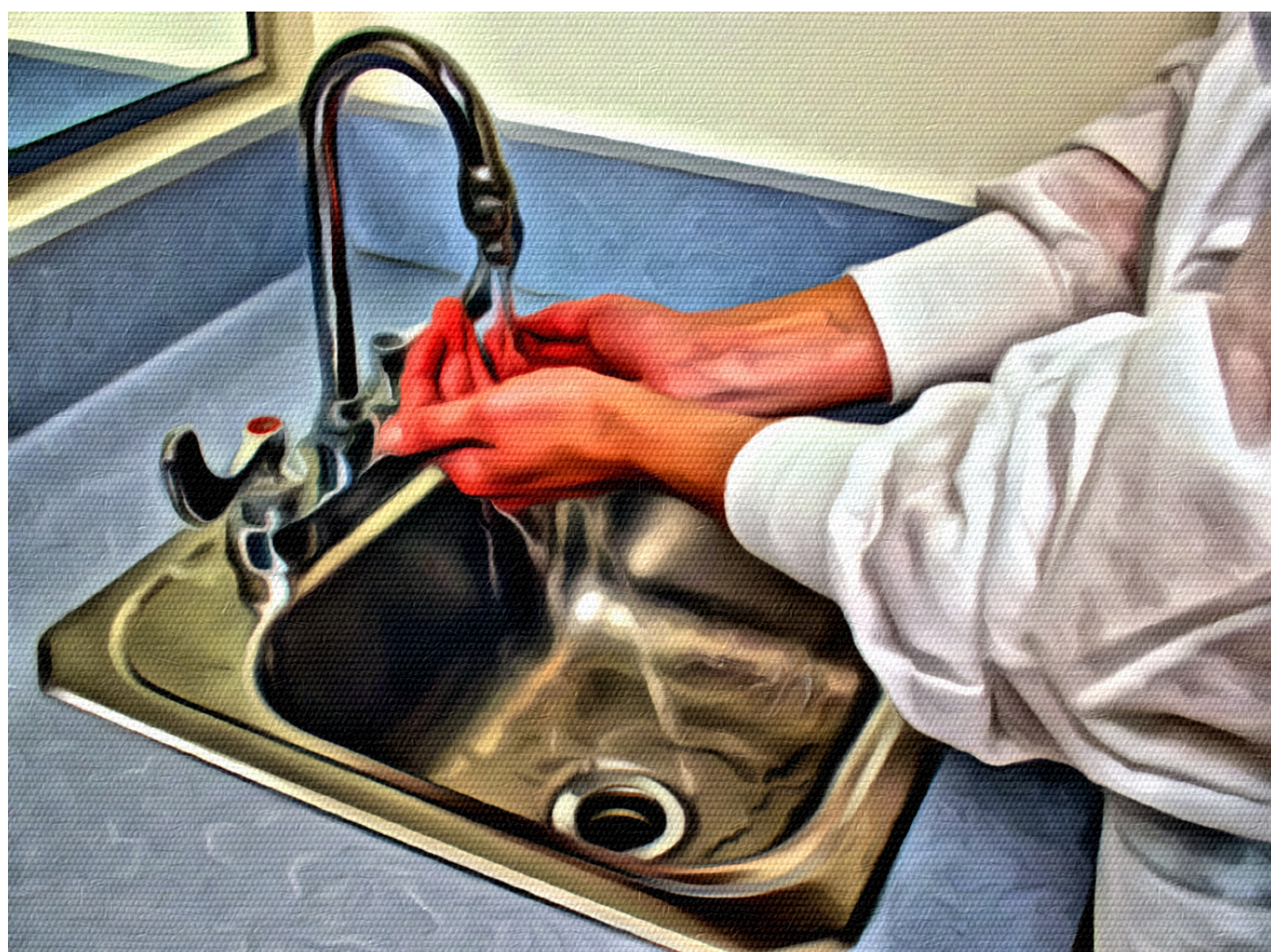
1. Rinse hands with warm running water