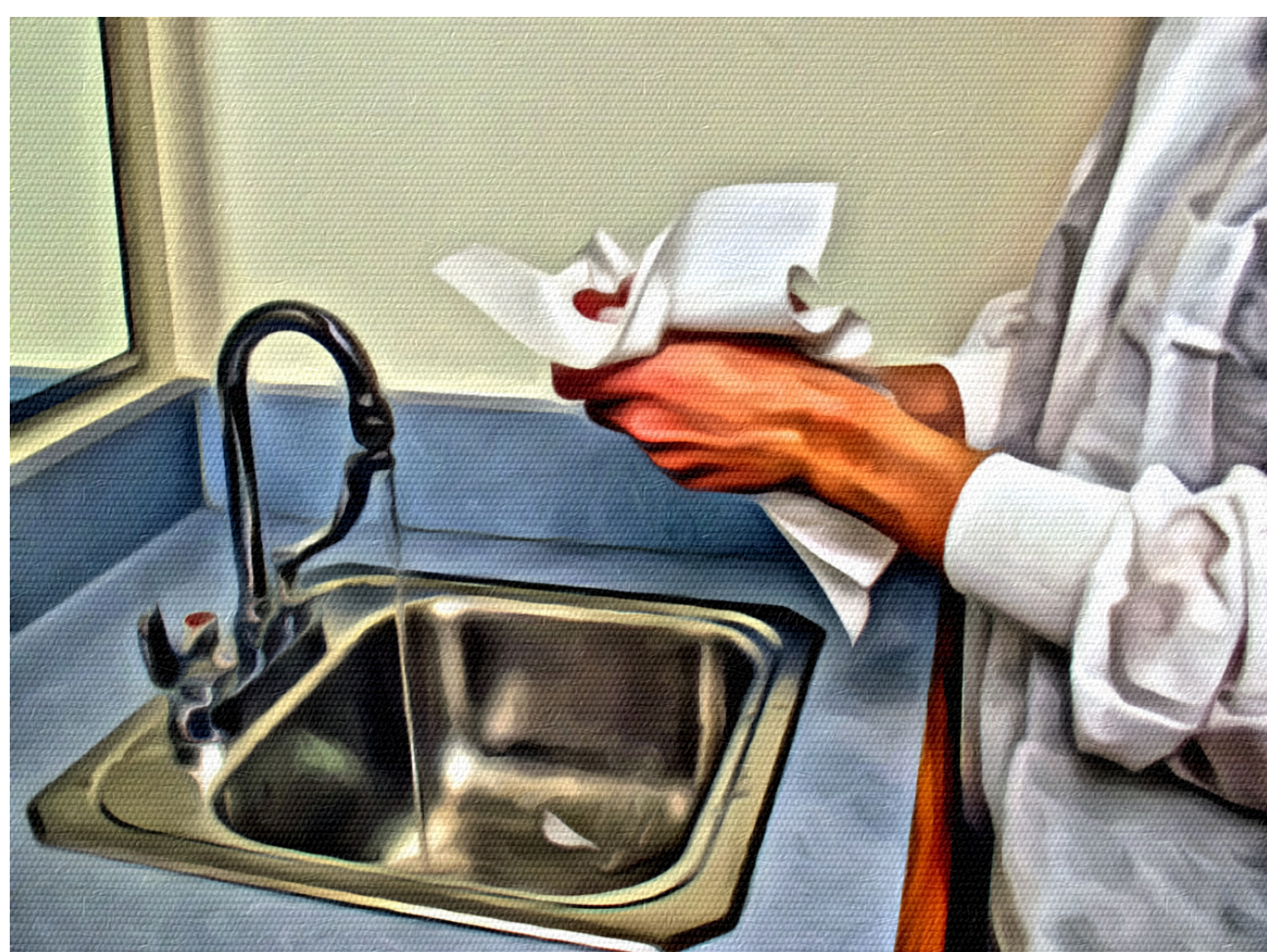
5. Dry hands with paper towels or other approve drying device