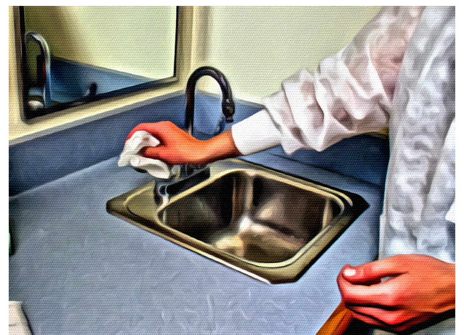
6. Turn off faucet with paper towels

Post this sign at sinks in staff bathrooms and at other sinks where staff who handle food, including bottles, wash their hands