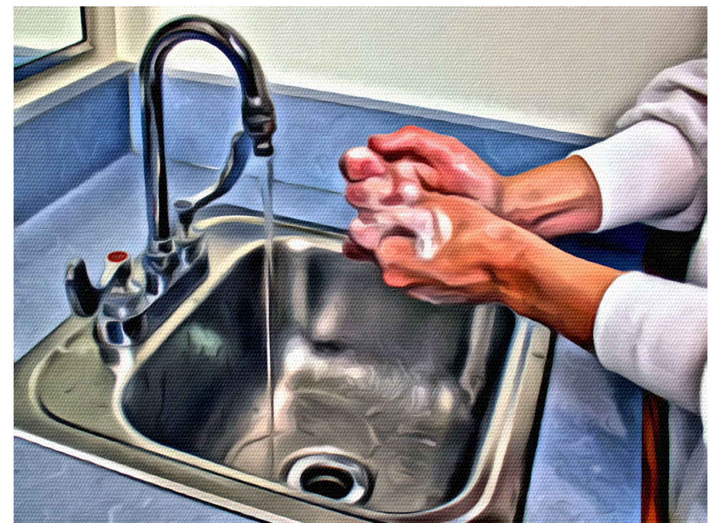
3. Rub hands together vigorously for 20 seconds