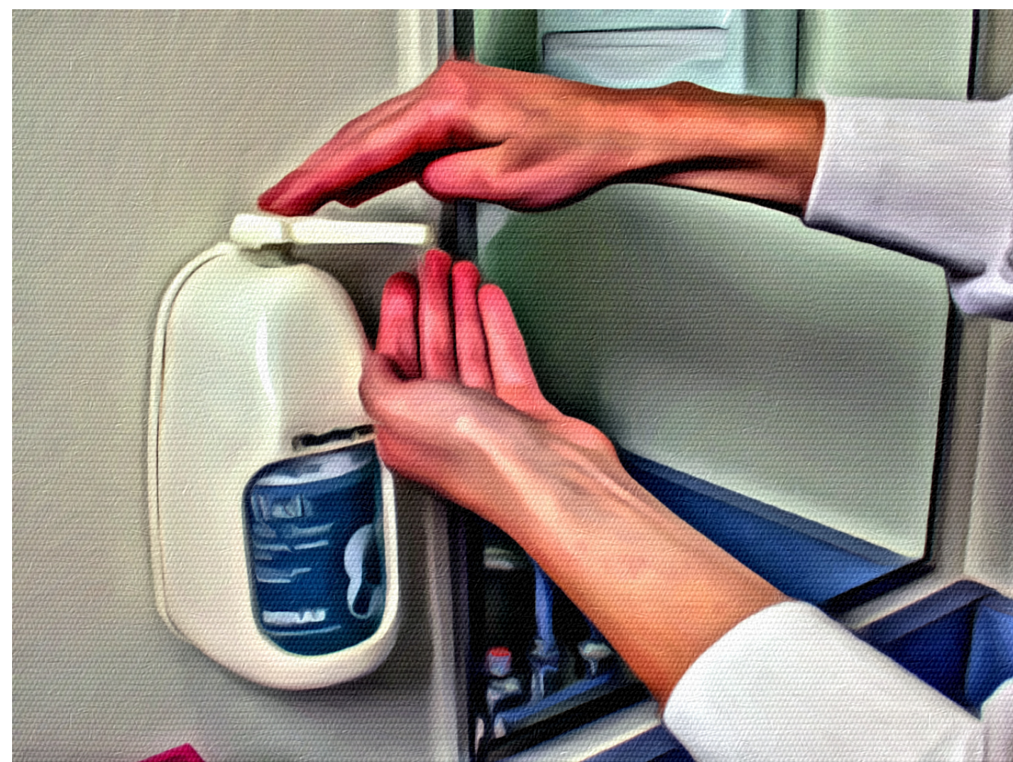
2. Apply soap